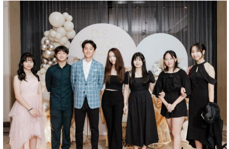
Student Council members also attended the dinner